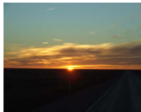
Sunrise on the Nullabor - about 7am heading East - weather whilst sunny was extremely cold!!