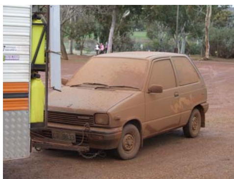
The little rig—covered in mud after the Navman took a short cut—gravel road in WA—you couldn't recognize her.