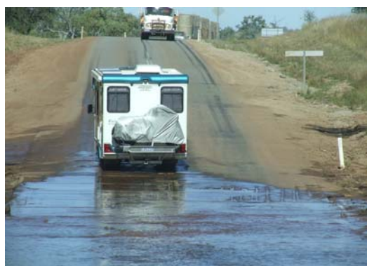
The only water over the road during the whole trip—must have been a broken water pipe!!