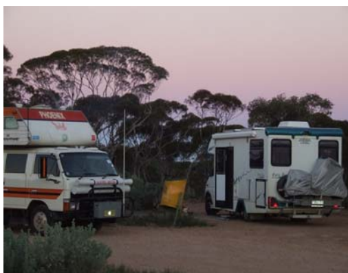
A typical rest area for overnight stay - most of our nights out were free stays throughout the trip