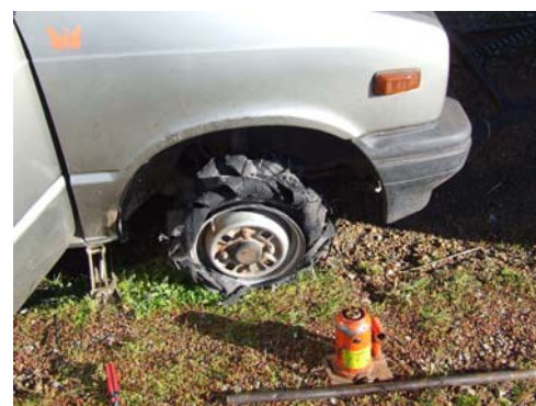
Front tyre on little rig - 80 kms east of Perth somewhat “buggered” - Needed to replace the other front tyre also during trip