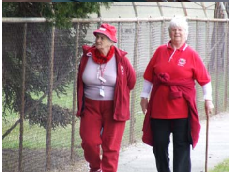
The long way home!!