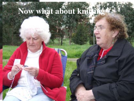
Now what about knitting