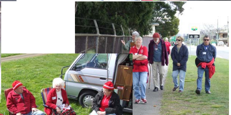
Weary walkers Only 1km to go