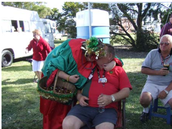
Mrs. Claus smothering someone!!

Finally a big thank you to all those whom participated in this wonderful gathering –your attendance and support was very much appreciated.