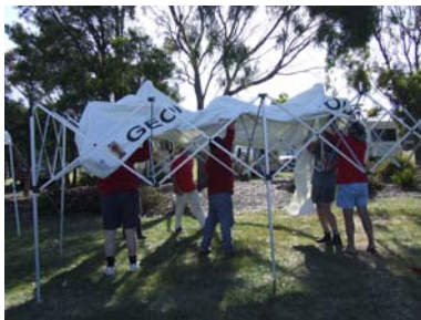
Packing up or mucking up!!