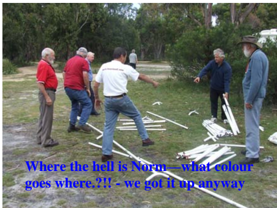
Where the hell is Norm— what colour goes where.?! - we got it up anyway