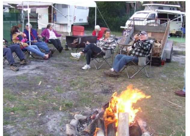
Happy Hour and after around the fire Members enjoy a sing along with our visitor from Qld/New York