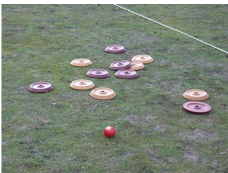
First end with our new Chapter set of bowls