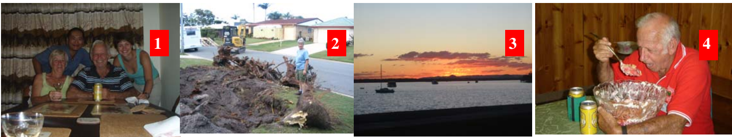
Some pictures from S&B— No 1 with visitors from UK—In No2 can't see Sam anywhere, working, probably at those RSL's checking things out, No 3 beautiful view and yes No 4—well that's probably why he is working off the weight a little (Bellingham 2007)