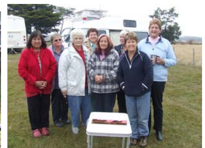
Our members and visitors celebrate Mother's Day with their cake-we all enjoyed for morning tea - Happy Mother's Day to all our members (mothers) who couldn't make the rally.