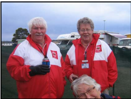
The “terrible twins” having fun!!