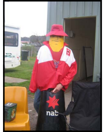
New member –stuffed if I know!!