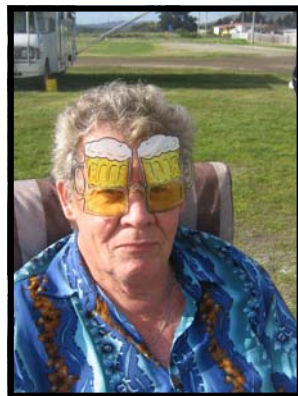
Drinking Glasses!! Now I’ve seen every- thing