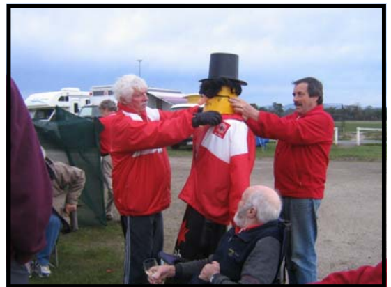
If that’s an effigy of the President - stop pulling him around