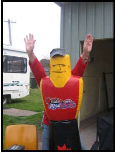
HELP-I give up –whoever you are!!