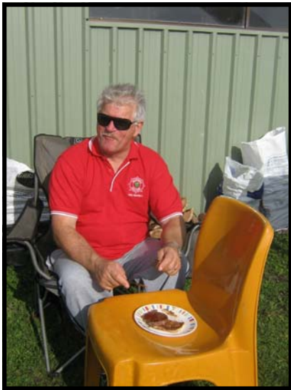
Our next host “feeding his face”