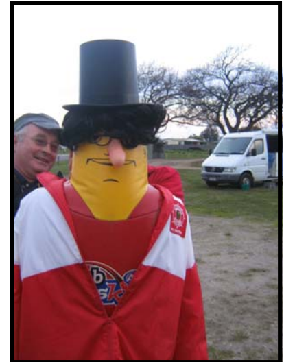
Is this the “Hanging Judge”??