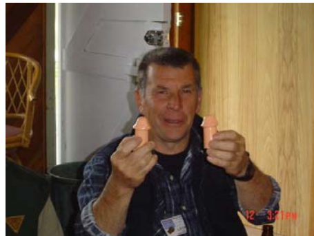
They are small mushrooms Leon!!