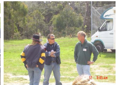
Some of our visitors

NEXT RALLY— NOVEMBER 14th to 21st inclusive at GEORGE TOWN (Regent Square) Anne St