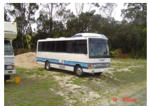
Is this a possible new member and a new rig!! - just dropped in for a visit.