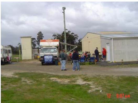
Happy Hour Friday afternoon