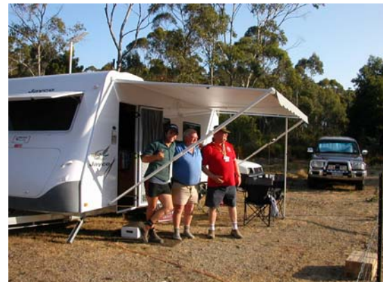
What's this - the President in a caravan –no worries - it was our Caterers for the Christmas BBQ – not a bad rig though!!