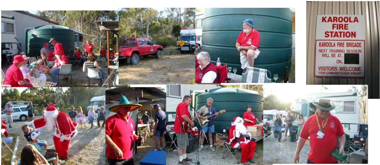
Some shots from the Karoola Rally—Father Christmas in his “red & white” could nearly be taken as a member of the Dalrymple Drifters Chapter