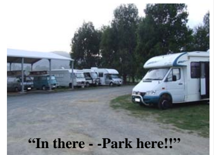
"In there - -Park here!!!"