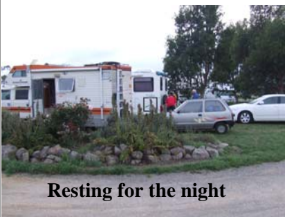
Resting for the night