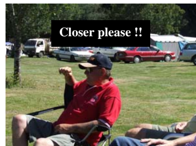
Closer please !!

Disc bowls practice at MP - is that an up and coming coach pointing out the mistakes!!