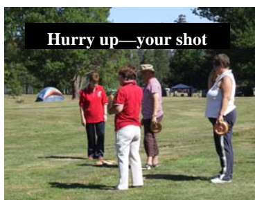
Hurry up—your shot