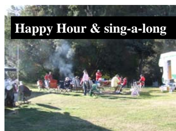
Happy Hour & sing-a-long