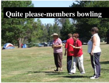
Quite please-members bowling