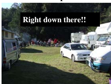
Right down there!!

Disc bowls practice at MP - is that an up and coming coach pointing out the mistakes!!