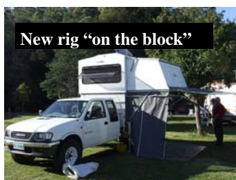
New rig "on the block"